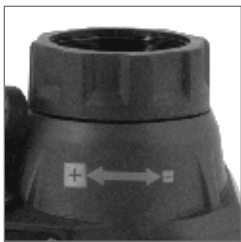
Rotate front lens for continuous 3-8x Zoom

9Hz unit is ideal for surveillance and is export ready. Device can be used in variety of search operations, firefighting and detection and other commercial applications.