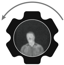
rotate lens counterclockwise for 8x view