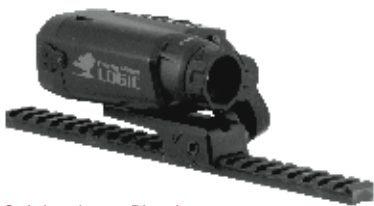
Quick-release Picatinny mount