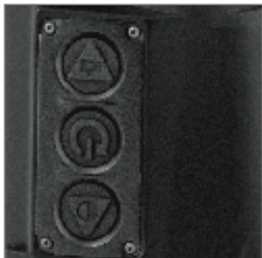
Advanced recording capabilities